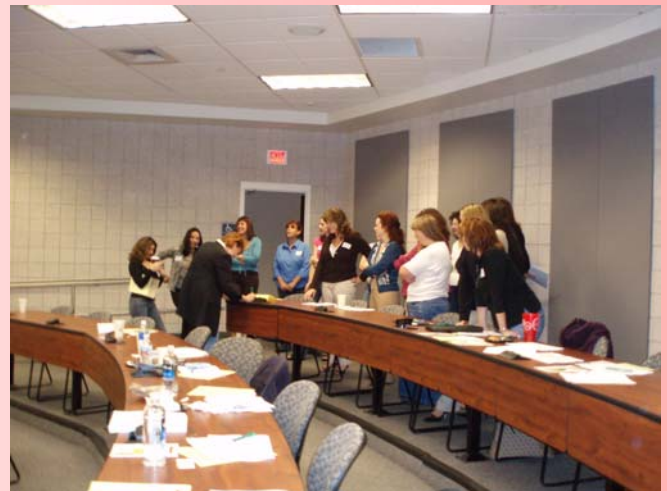
Participants preparing for a negotiation exercise.